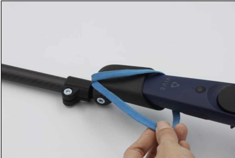
3. Pass the strap under the controller