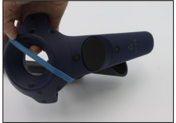
2. Pass the controller into the strap